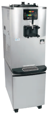
Optional cart with front opening door