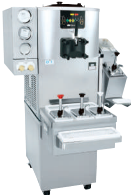
Optional cart with rear door for front mount syrup rail