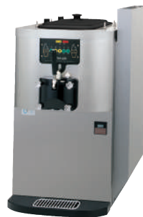
Optional top air discharge chute

750 N. Blackhawk Blvd. Rockton, Illinois 61072 800-255-0626 Phone 815-624-8333 Fax 815-624-8000 www.taylor-company.com info@taylor-company.com