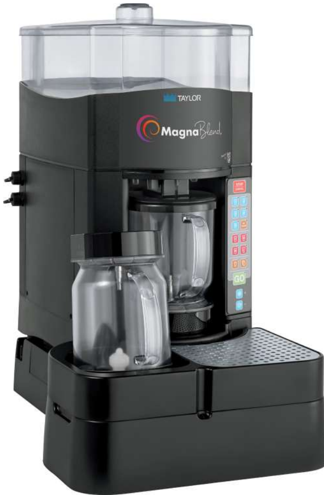
Shown with standard ice hopper